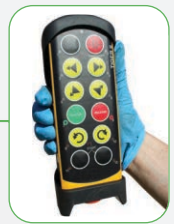
Radio remote control as standard for vacuum head