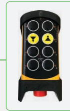
Optional radio remote control