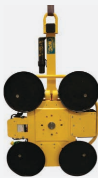
MRT4 - Compact Pad View