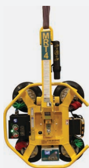
MRT4 - Compact

The Intelli-Grip technology monitors vacuum lifters in real-time.