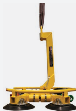
MRT4 - Compact Tilted View