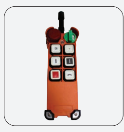
Optional radio remote control