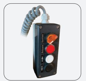
Cable remote control as standard