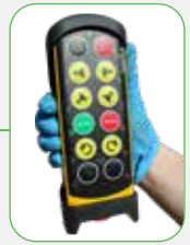
Radio remote control as standard for vacuum head