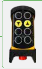
Optional radio remote control