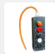
Cable remote control comes as standard