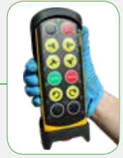
Radio remote control as standard for vacuum head